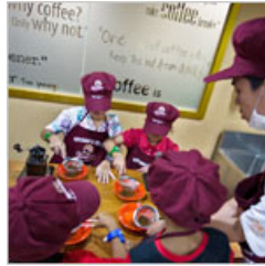
Indonesians’ Main Language is Often English