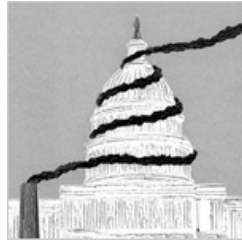
Op-Ed: Four Ways to Kill a Climate Bill