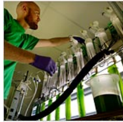
Exploring Algae as Fuel