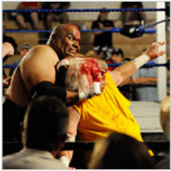
Still the Butcher After All These Years