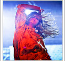
Eight Hours on an Island of Noise

Why free will has nothing to fear from neuroscience — or from God.